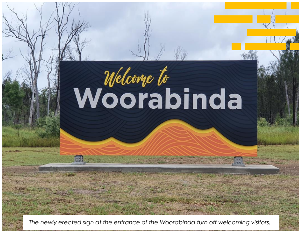
The newly erected sign at the entrance of the Woorabinda turn off welcoming visitors.